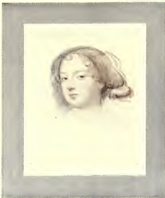
MISS CHRISTIAN TEMPLE BY OR AFTER SAMUEL COOPER

FROM THE COLLECTION OF THE RT. HON. SIR CHARLES DILKE, BART., M.P.